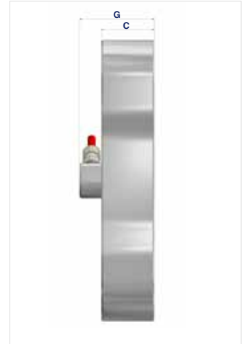
Load links typical dimensions - bespoke design available on request